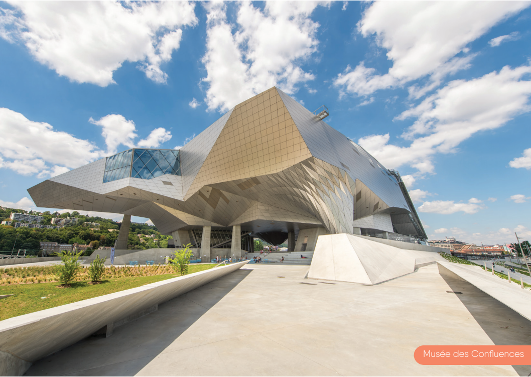
Musée des Confluences