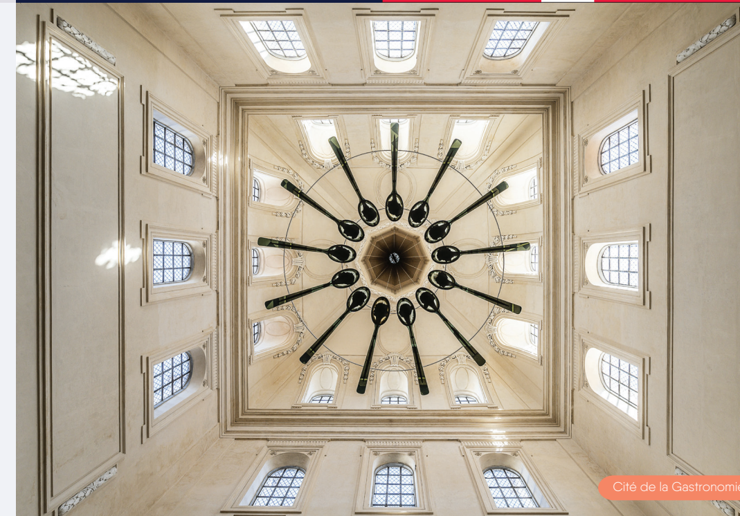
Cité de la Gastronomie